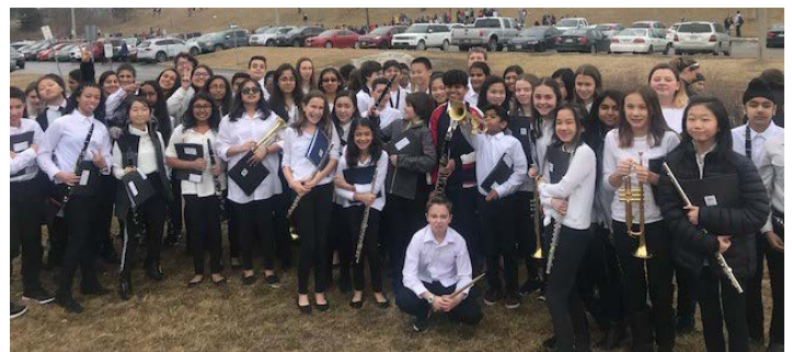
Intermediate Band at Music Alive